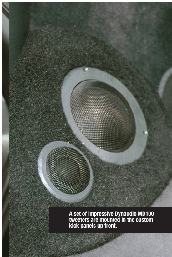
A set of impressive Dynaudio MD100 tweeters are mounted in the custom kick panels up front.

midrange, as well as the Dynaudio MD100 tweeters mounted in the custom kick panels in front. An Arc Audio 4050XXK amplifier takes care of the Dynaudio System 240GT speakers that provide rear fill. Bringing the pain is a quartet of inversely-mounted Arc Audio 10D4 10-inch subwoofers in custom enclosures, flanking the amplifiers (including the Arc Audio 2500XXK that powers them) in the centre. All in all, Vina and Lynch were able to successfully design a multimedia system that only occupied 20% of the Passat's storage area.